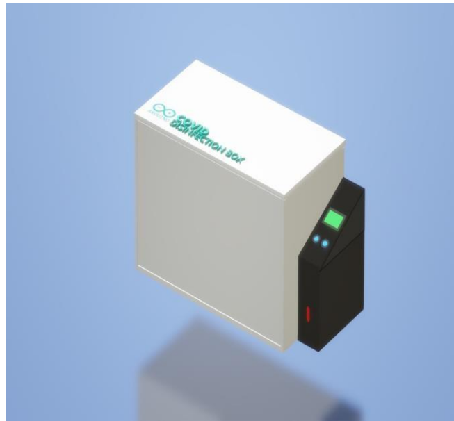
Fig. 2. A whole diagram of the sterilization box.