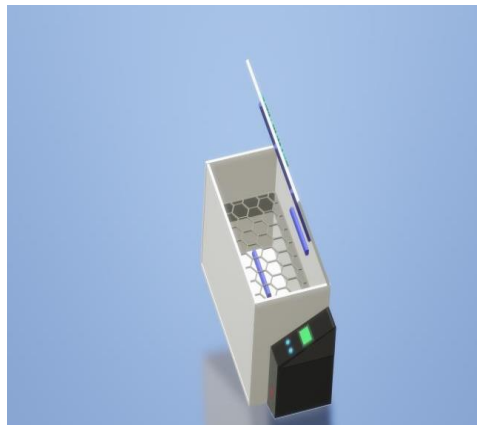
Fig. 1. Photograph of the sterilization box.